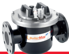
BoilerMag XT (filter to suit 1½"-12" pipes)