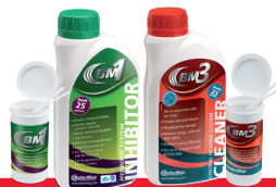
BM1 Inhibitor & Test Strips BM3 Cleaner & Test Strips

BoilerMag North America 442 Millen Road Unit #9, Stoney Creek, Ontario, L8E 6H2 T 1-800-260-2124 F 1-800-260-1410 sales@eclipsetoolsinc.com www.boilermag.com/na